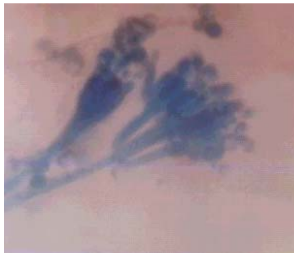
Figure (4) Lactophenol cotton blue stain of Penicillium nonatum showing