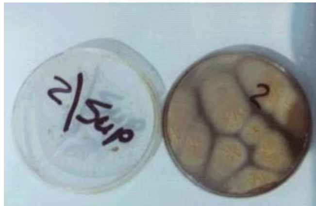
Figure (3) Culture of Alternaria alternata on Sabouraud's dextrose agar.