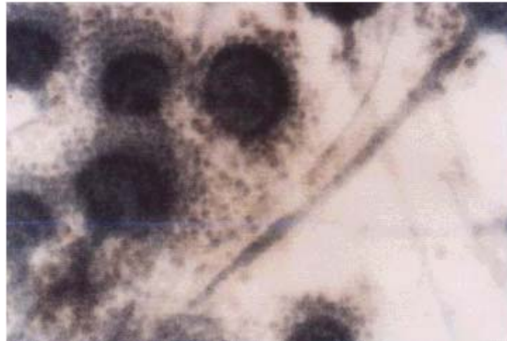
Figure (1) Lactophenol cotton blue stain of Aspergillus flavus .

Culture plates were examined after four weeks macroscopically, and microscopically for the identification of the conidia morphology (type and arrangement), figures (1-4).